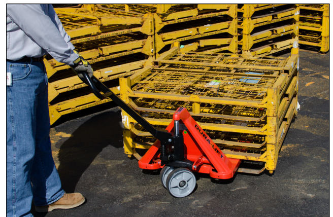
Different fork lengths and widths available