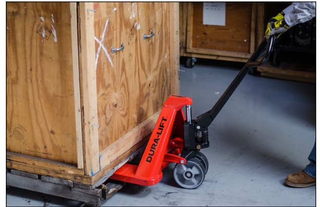
5,500 lb capacity