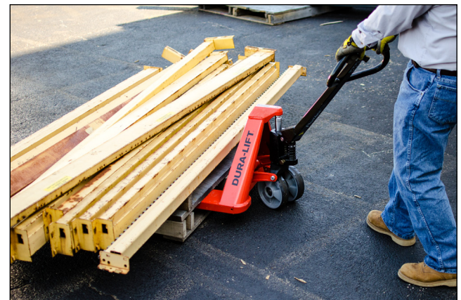
Low fork clearance